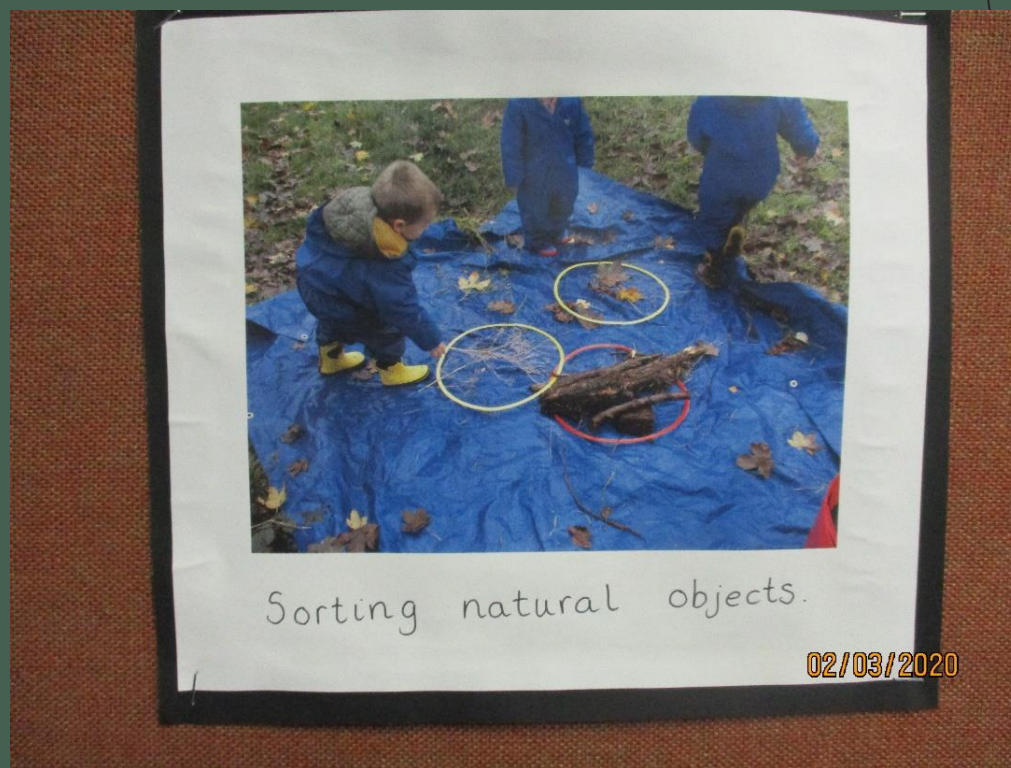
Sorting natural objects.

Maths activities sorting, comparing size, counting activities.